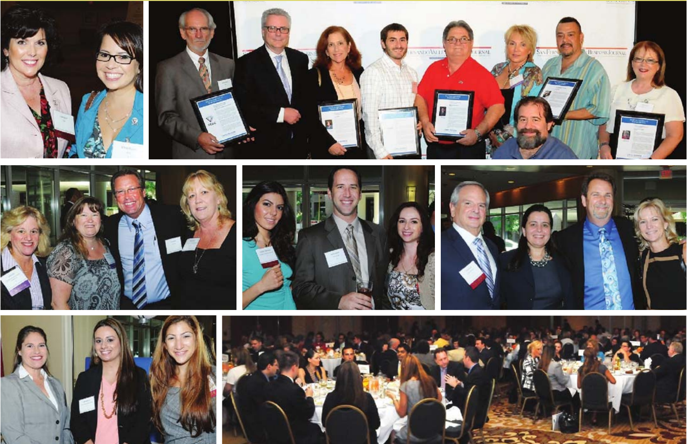
On October 17, the San Fernando Valley Business Journal hosted the Small Business Leadership Awards at the Warner Center Marriott with 280 attendees.